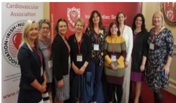
Some committee members. October 2019