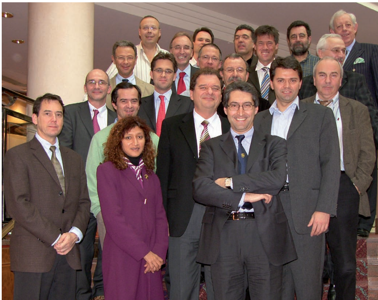
EAPCI Board 2006-2009.

Rows from left to right and from bottom to top,