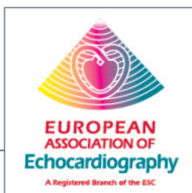
Petros Nihoyannopoulos President of the European Association of Echocardiography

Finally, a number of documents have now been produced by the EAE to offer recommendations in various clinical settings. The first two will be published in the EJE during 2008 on stress echocardiography and EAE Recommendations for Standardisation of Performance, Digital Storage and Reporting of Echocardiographic Studies.